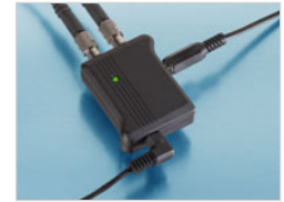
Optoacoustics EOU 100 electro-optic unit showing fiber optic, audio, and power supply connections

Optoacoustics' OPTIMIC 1160 system is comprised of our advanced OPTIMIC fiber optic microphone, electro-optic unit, audio cable with BNC connector, DC power supply and a ruggedized carrying case.