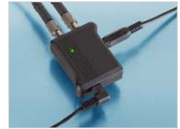
Optoacoustics EOU 100 electro-optic unit showing fiber optic, audio, and power supply connections

Optoacoustics' OPTIMIC 1155 system is comprised of our advanced OPTIMIC fiber optic microphone, electro-optic unit, audio cable with BNC connector, DC power supply and a ruggedized carrying case.