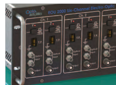
The rack-mountable EOU 2100 multi-channel electro-optical unit supports simultaneous monitoring by up to six single axis FOSA units.

Optoacoustics' FOSA system is purely analog with standard line output. It does not require any additional pre-amplifiers or amplifiers. Each sensor is calibrated individually to its nominal performance specifications at the factory, and is guaranteed to perform flawlessly throughout its lifetime.